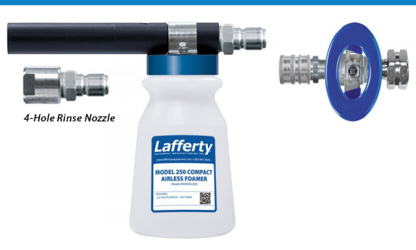
4-Hole Rinse Nozzle